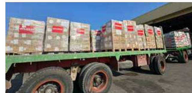
• The third humanitarian aid mission from Malaysia to Gazans under "Ops Ihsan" successfully arrived at the El Arish International Airport in Egypt,

The goods received by the Egyptian Red Crescent Society will be taken into Gaza through the Rafah border before being handed over to the Palestine Red Crescent Society, which will be responsible for distributing them to hospitals and also to those in need in Gaza.