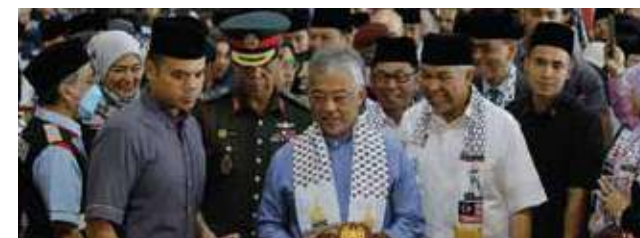
• The Yang di-Pertuan Agong, Al-Sultan Abdullah Ri'ayatuddin Al-Mustafa Billah Shah on Monday (Dec 18) witnessed preparations for Malaysia's third delivery of the Ops Ihsan humanitarian aid for the Palestinian people at the Kuala Lumpur International Airport (KLIA) cargo terminal here.

The collective and integrated efforts of the Foreign Ministry, government agencies and over 60 non-governmental organisations (NGOs), coupled with the spirit of Malaysians, proved crucial in the success of Ops Ihsan. Ops Ihsan has proven to be effective through the structured and efficient management and use of resources and expertise of the various organisations involved. This collaboration has managed to prevent overlapping and misappropriation to ensure the aid provided met their requirements and reached those in need.